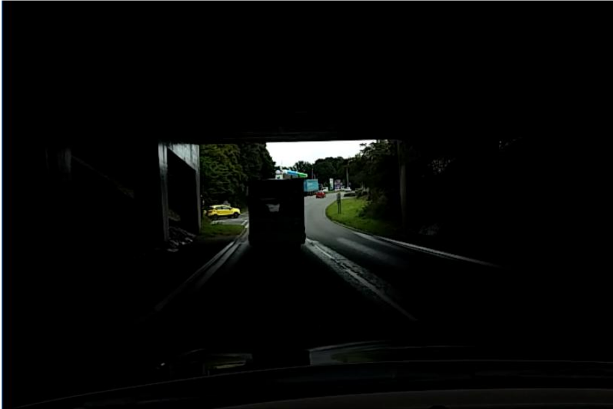
Manual exposure set from a bright day showing under exposed image in an underpass

When working with manual exposure, a setting can be found that will make the best compromise between foreground detail and underexposed background detail. This setting best works where the light levels will remain relatively constant throughout the video. If this setting is used when going under a bridge this could result in loss of detail due to under exposure.