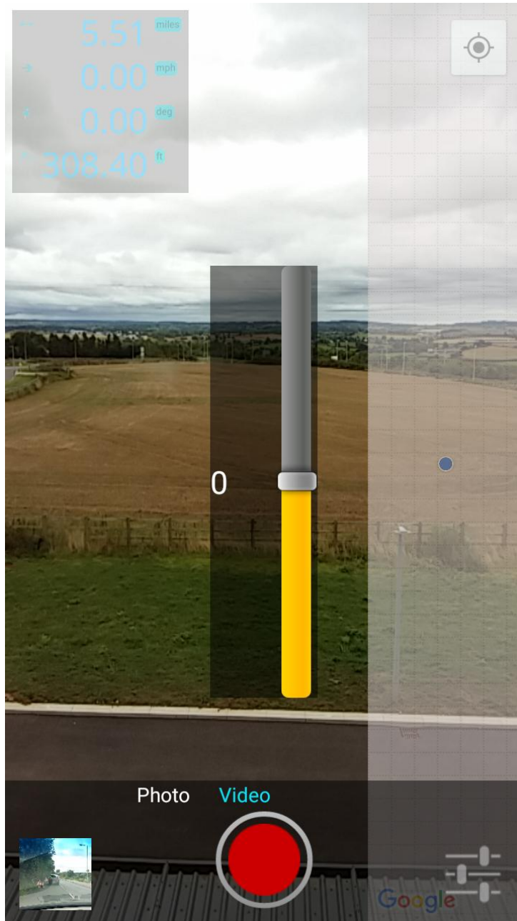
Exposure Compensation Value

Use the slider to set the desired exposure compensation value.